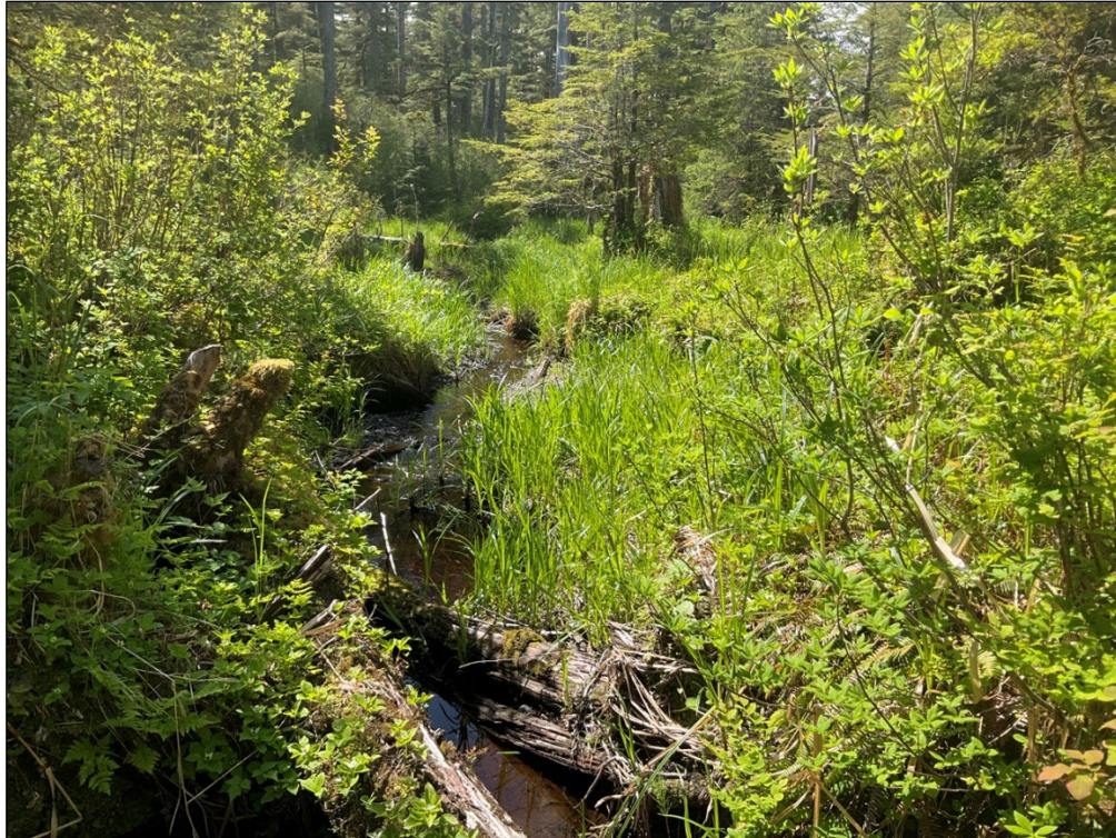
Figure 2.—Channel upstream of waypoint 169.