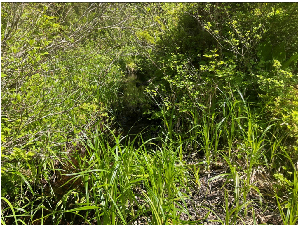
Figure 3.—Channel downstream of waypoint 169.