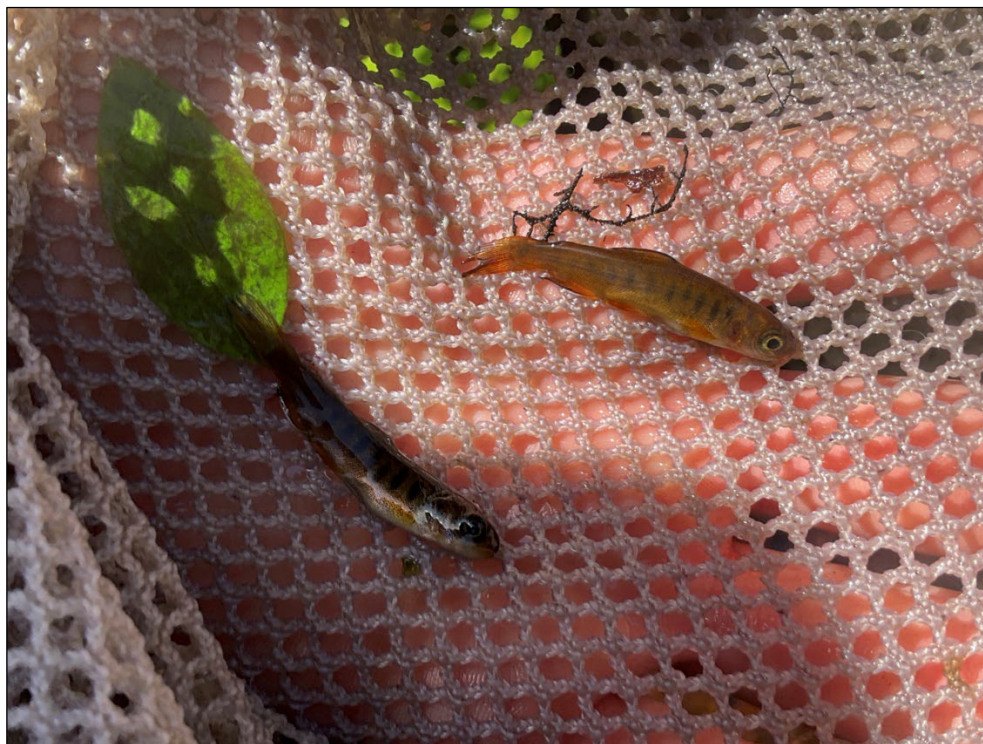
Figure 1.—Juvenile coho salmon captured at waypoint 169.